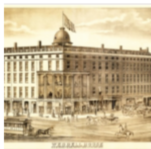
Cleveland, Ohio: Weddell House, 1840s