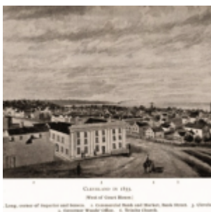
Cleveland, Ohio: Public Square, Looking NW, 1835