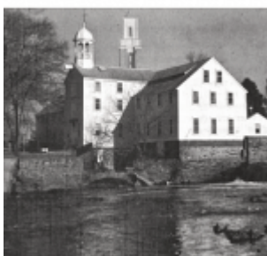
Slater Textile Mills, Pawtucket, Rhode Island, 1793