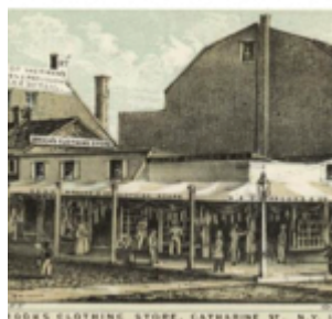
Busy Manhattan Street Scene, 1818