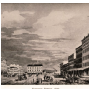
Cleveland, Ohio: Superior Street, about 1846