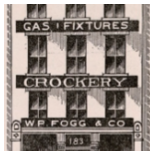
Cleveland, Ohio W.P. Fogg & Co., about 1870