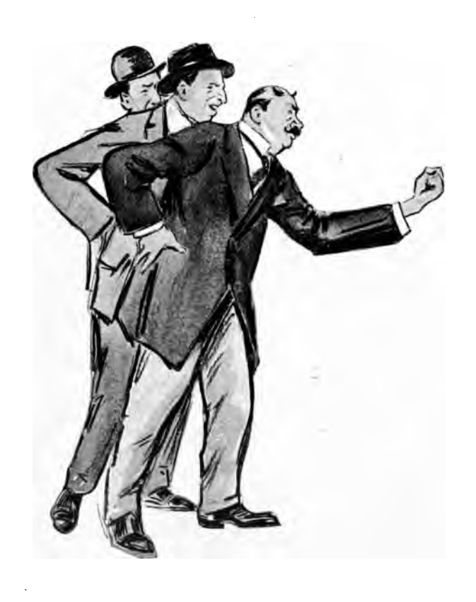
FOR SOME ODD REASON THE WHOLESALE LIQUOR DEALERS' ASSOCIATION