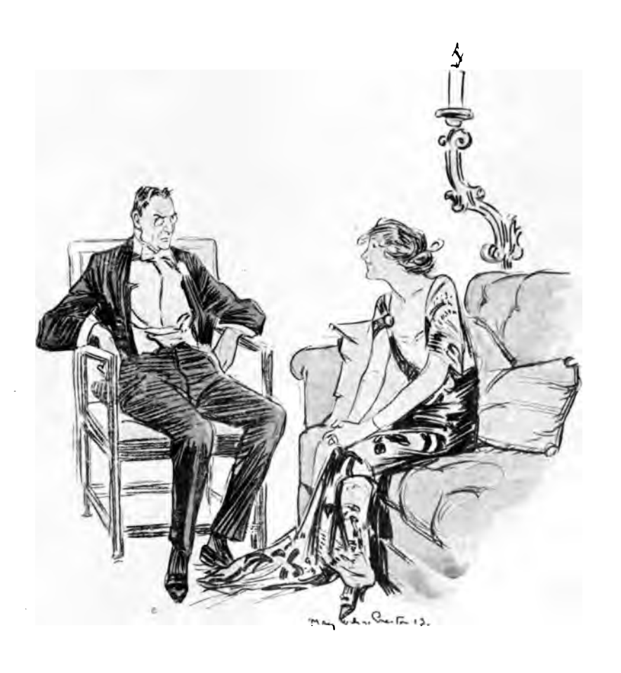
"OH, MR. BLANK," SHE SAID, "DO YOU THINK WOMEN SHOULD VOTE?"