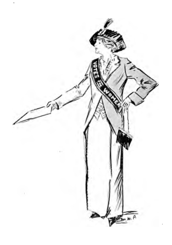
DOESN'T HAPPEN TO LIKE THE IDEA OF FEMALE SUFFRAGE.